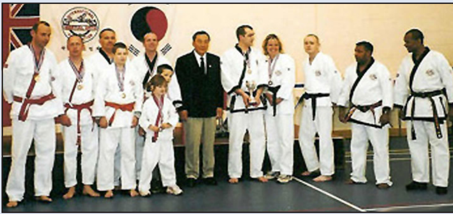
Photo: Master Nar's Bedford Tigers take Team Grand Championship at 1st All Euro Championships